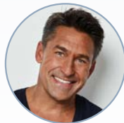
Jamie Durie Host of Jamie Durie's Future House