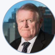
The Hon. Rob Gerard Kerin