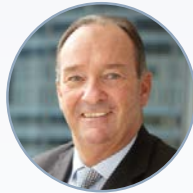
The Hon Mark Vaile AO