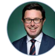
Hon David Littleproud MP Leader of the Nationals