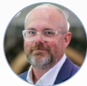
The Hon Senator Tim Ayres Minister for Industry & Innovation, and Minister for Science